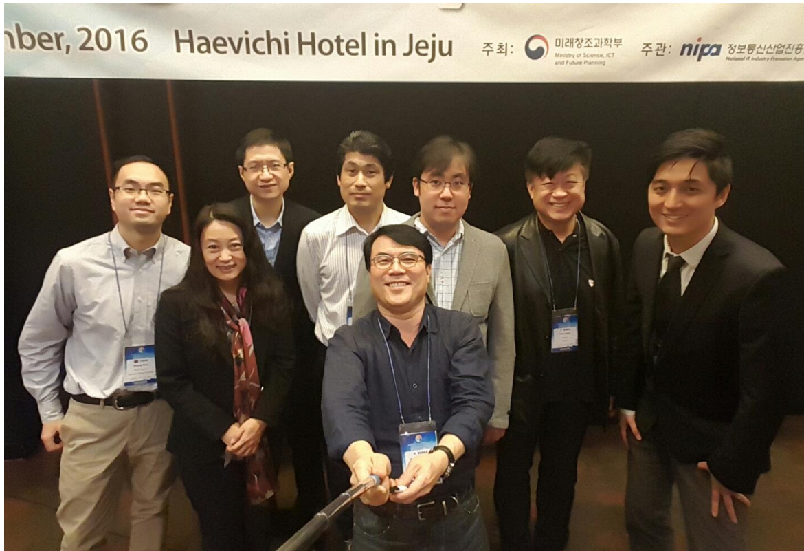
WG2 members in Naha, 2012