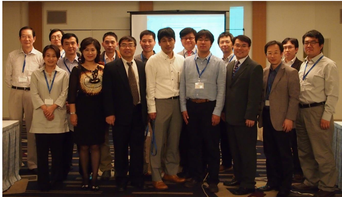
WG2 members in Naha, 2012