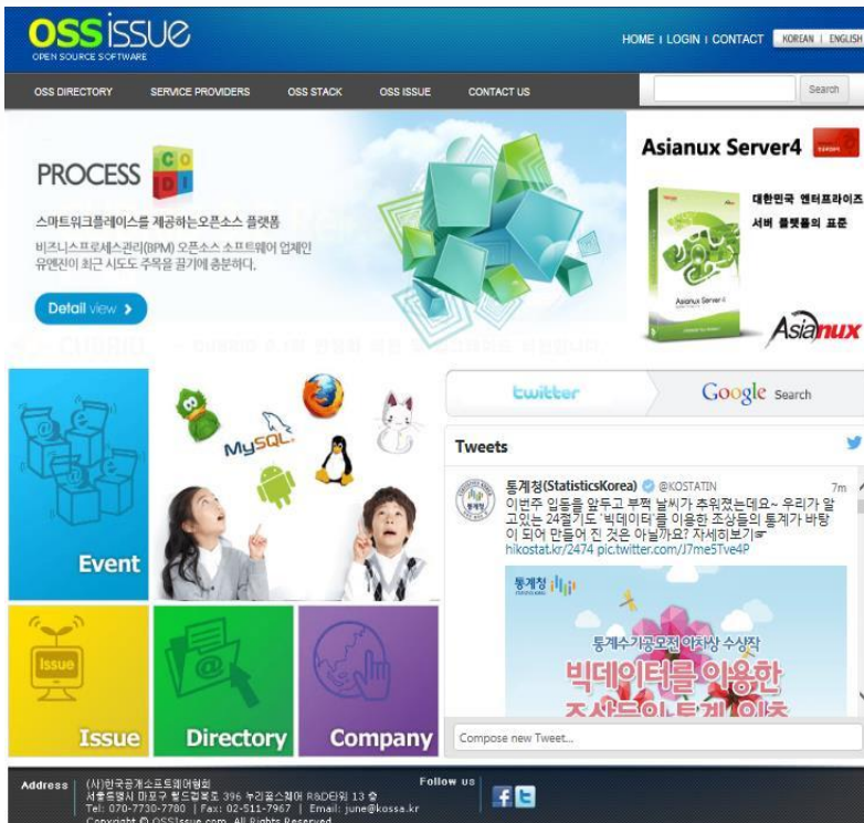
[ossissue.com Main Page]