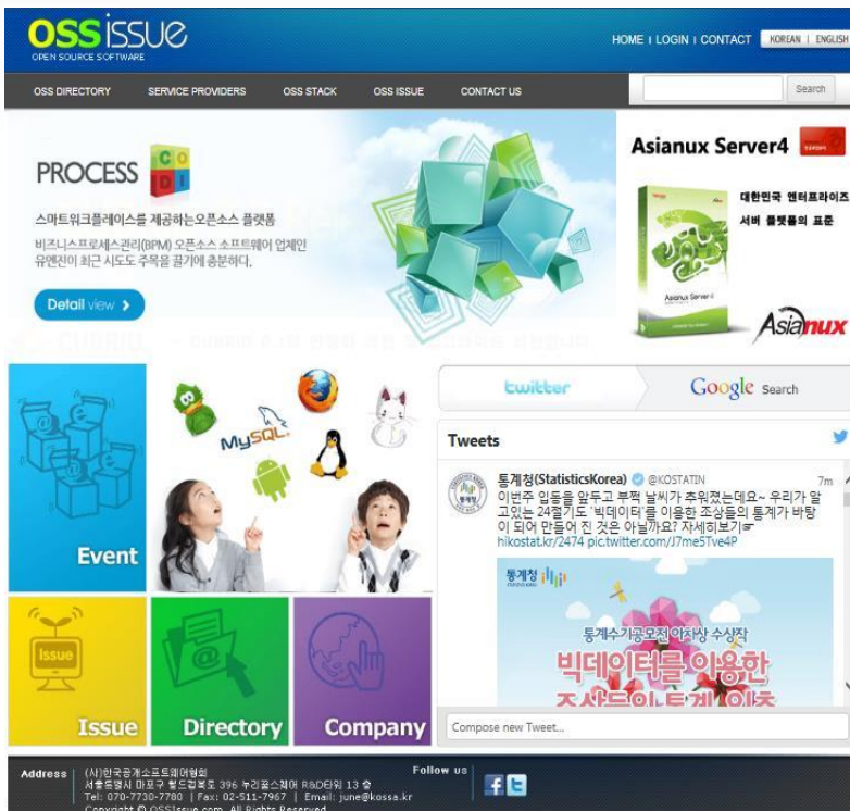
[ossissue.com Main Page]